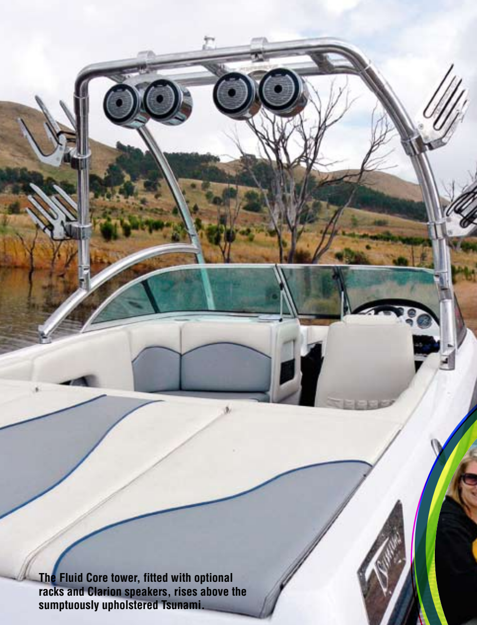
The Fluid Core tower, fitted with optional racks and Clarion speakers, rises above the sumptuously upholstered Tsunami.