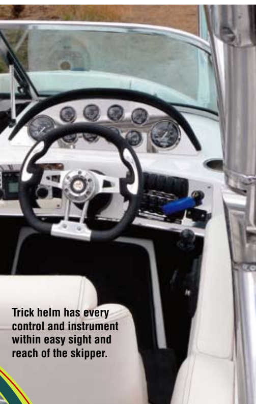
Trick helm has every control and instrument within easy sight and reach of the skipper.

exhilarating handling at all speeds. The Tsunami also turns very well at low speeds for picking up skiers, docking and trailering.