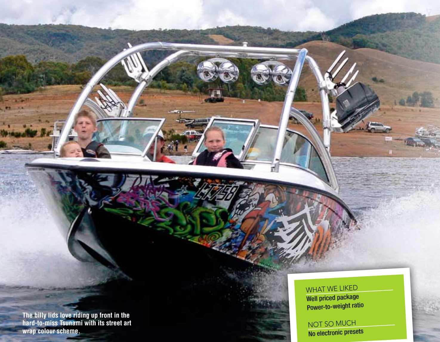
The billy lids love riding up front in the hard-to-miss Tsunami with its street art wrap colour scheme.

WHAT WE LIKED Well priced package Power-to-weight ratio