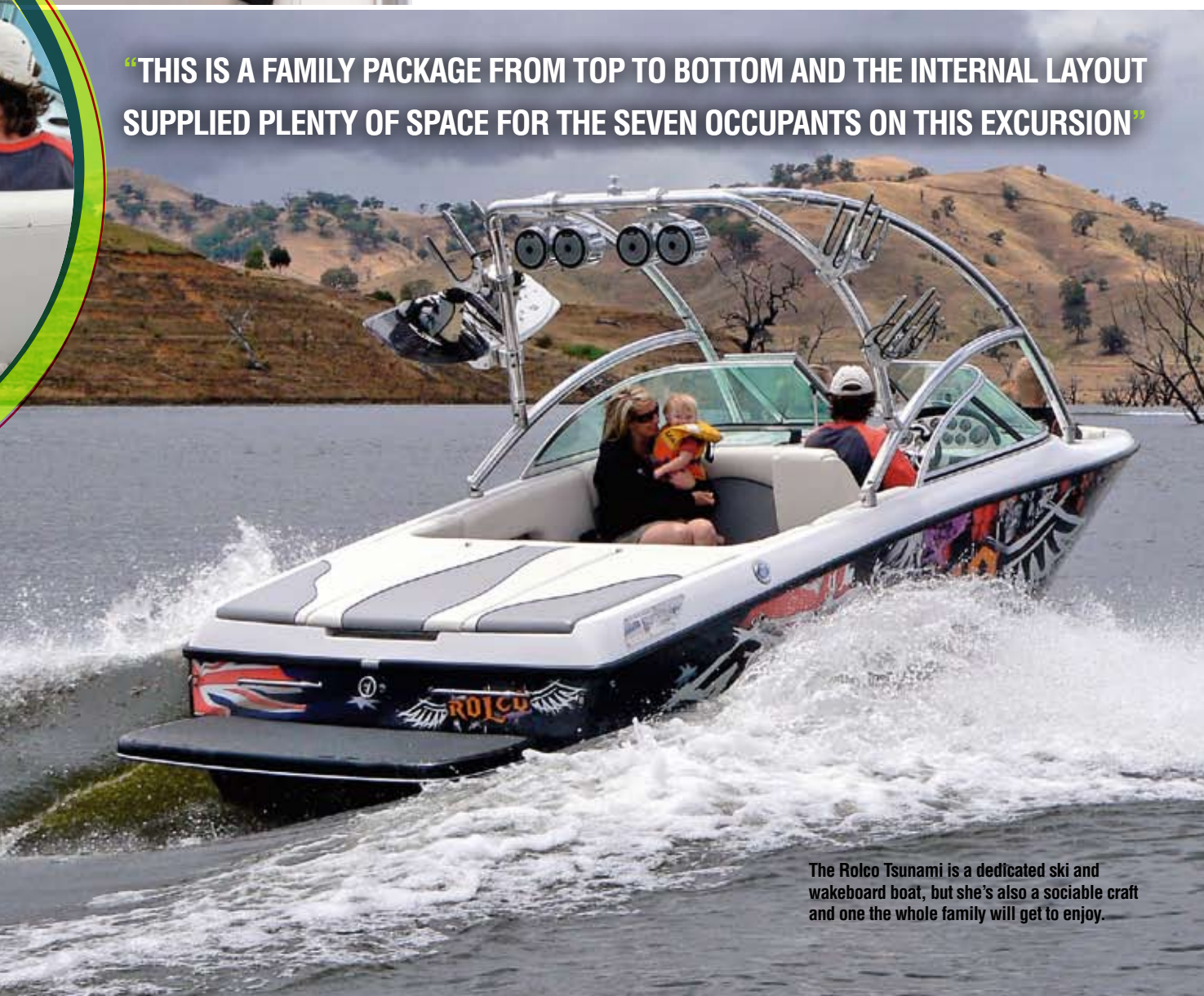
The Rolco Tsunami is a dedicated ski and wakeboard boat, but she's also a sociable craft and one the whole family will get to enjoy.

"THIS IS A FAMILY PACKAGE FROM TOP TO BOTTOM AND THE INTERNAL LAYOUT SUPPLIED PLENTY OF SPACE FOR THE SEVEN OCCUPANTS ON THIS EXCURSION"