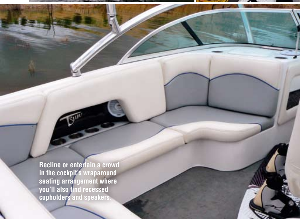
Recline or entertain a crowd in the cockpit's wraparound seating arrangement where you'll also find recessed cupholders and speakers.