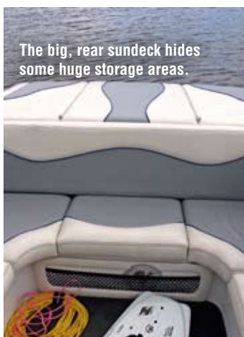
The big, rear sundeck hides some huge storage areas.