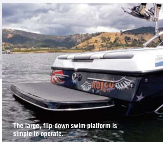
The large, flip-down swim platform is simple to operate.

I think I'll make a point of clearing the cobwebs and rocking the foundations a little more often with the help of the good people at Rolco. 🚤